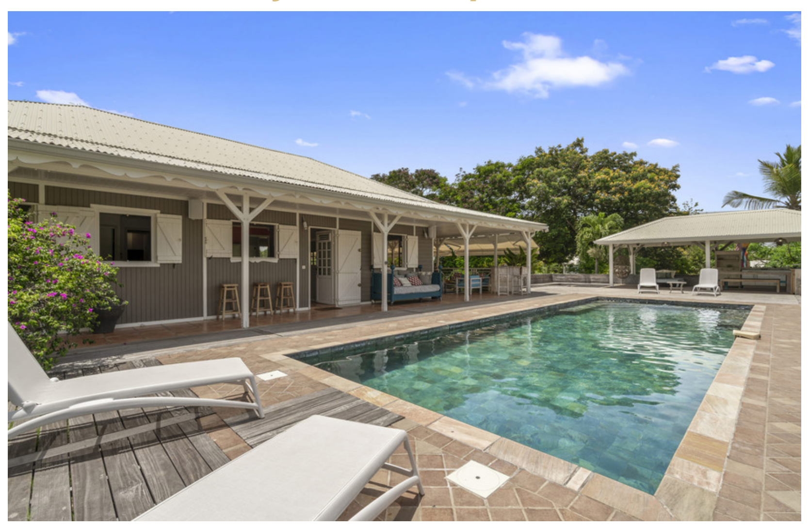
From 350.0 € / night - 5 bedroom(s) - 5 bathroom(s)