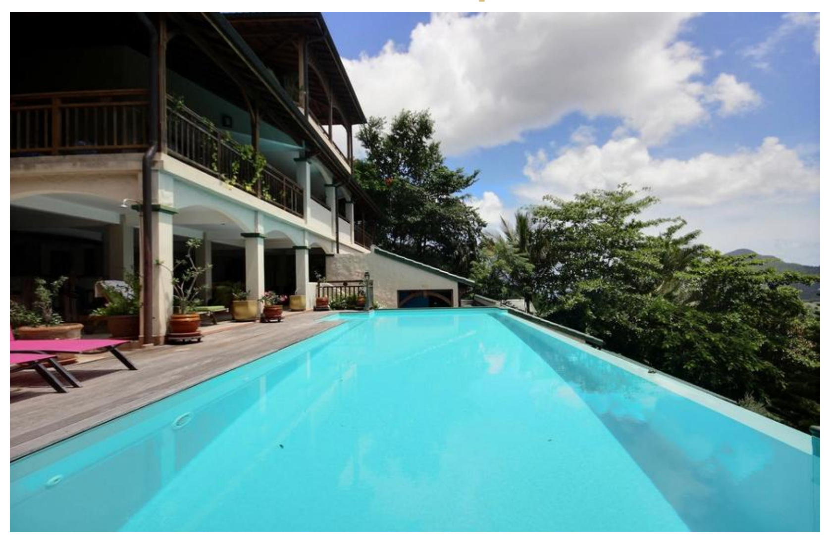
From 105.0 € / night - 0 bedroom(s) - 1 bathroom(s)