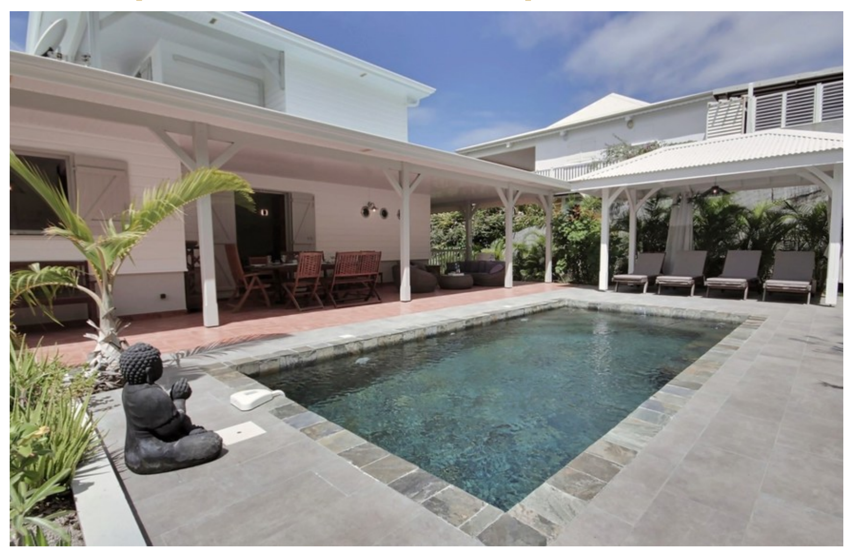
From 175.0 € / night - 3 bedroom(s) - 2 bathroom(s)