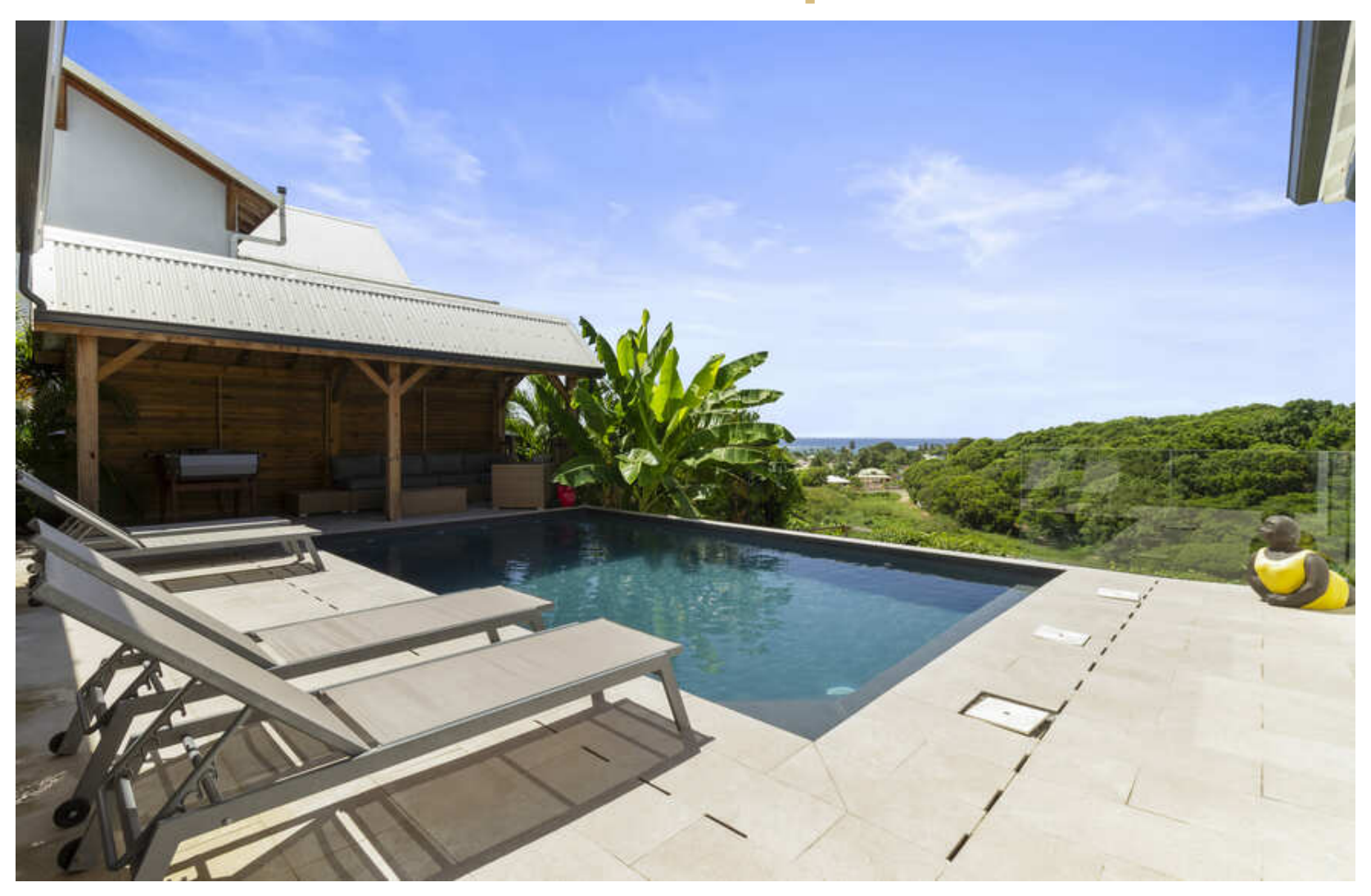
From 315.0 € / night - 5 bedroom(s) - 3 bathroom(s)