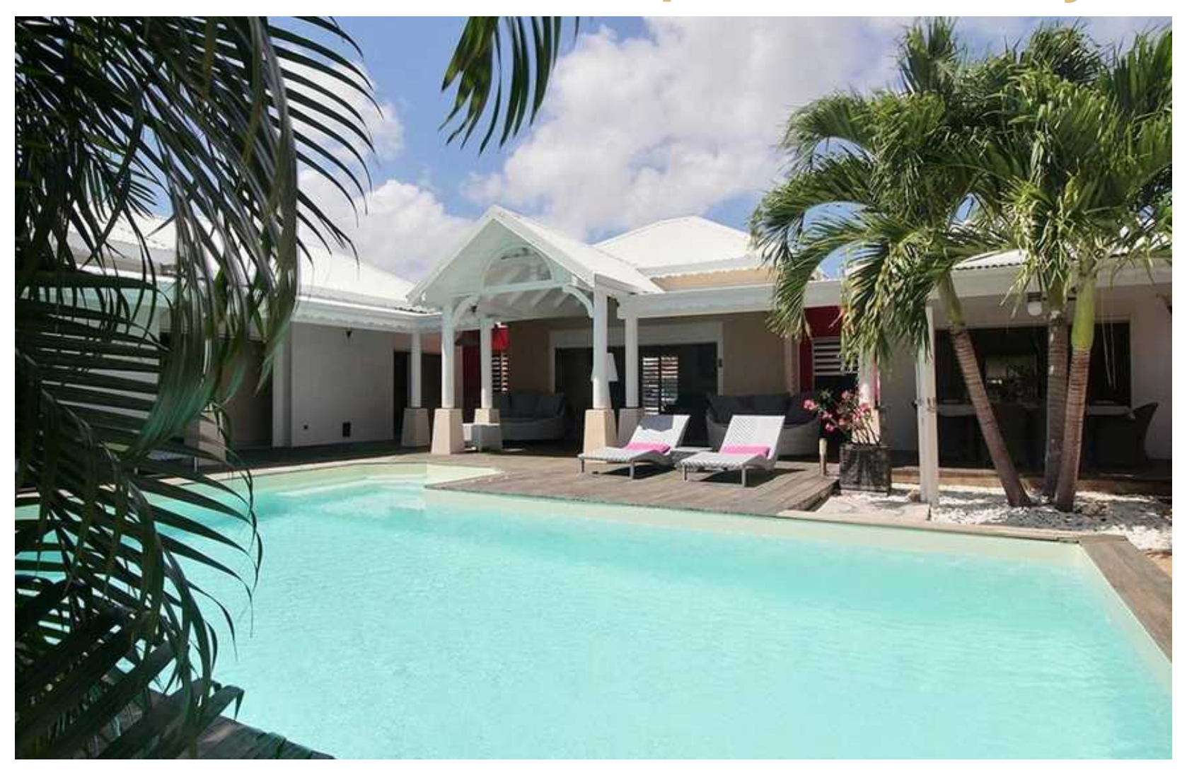
From 308.57 € / night - 4 bedroom(s) - 3 bathroom(s)