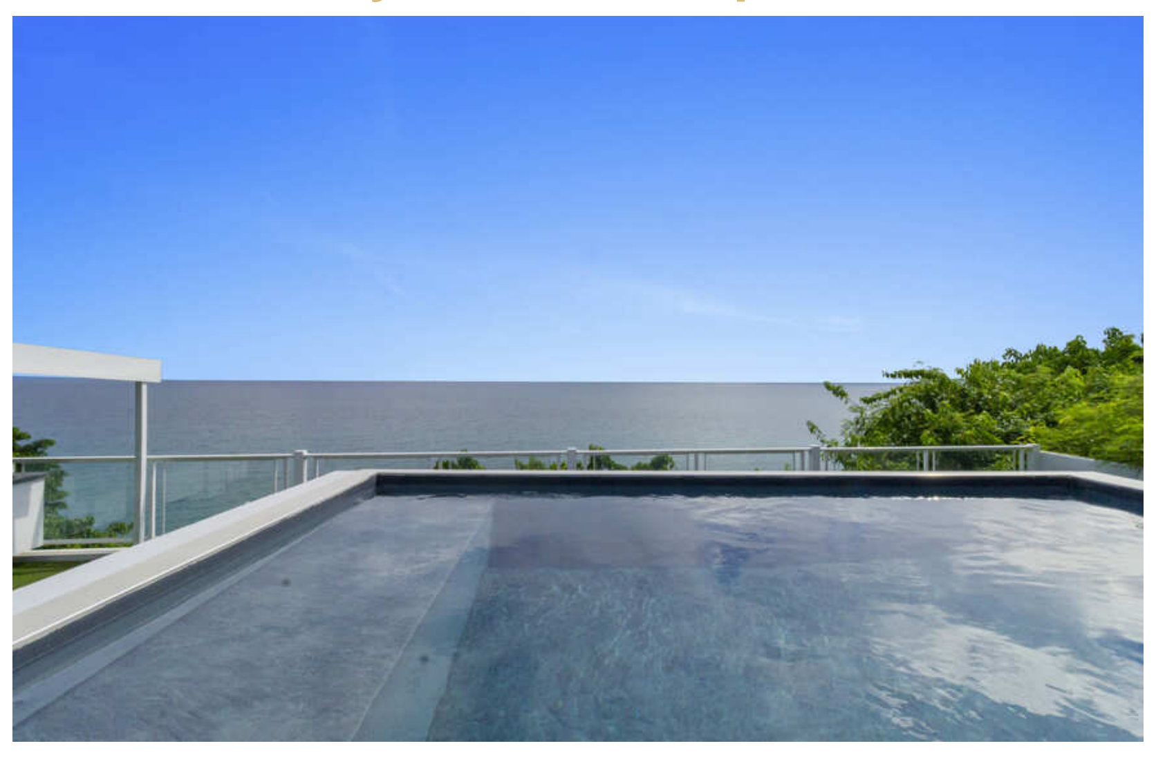
From 550.0 € / night - 5 bedroom(s) - 5 bathroom(s)